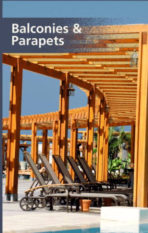
Balconies & Parapets