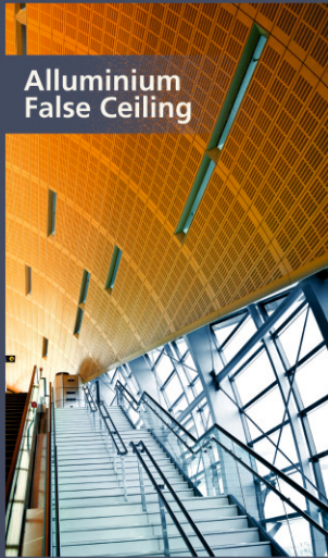
Alluminium False Ceiling